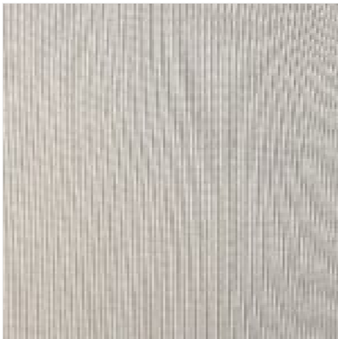
Fine Ribbed Structure