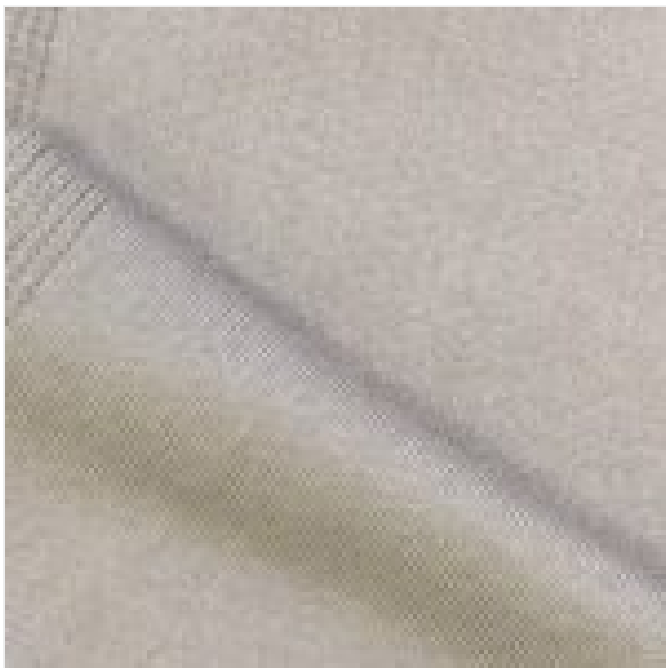
Elegant Drape & Soft Texture